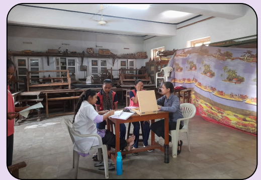
School screening activity organised by Vyara centre team