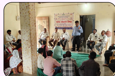
Community meeting at Nasarpur for Umapada vision centre