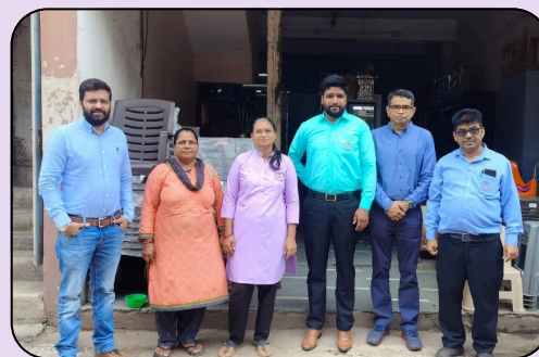
VFI guest with Kosamba centre staff