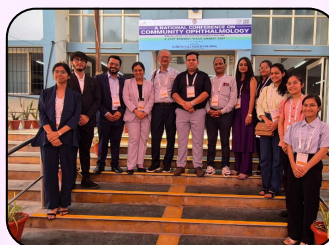
Divyajyot trust team at the Vision 2020 19th annual conference