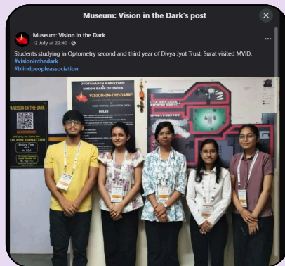
Optometry students visiting museum Vision in the dark