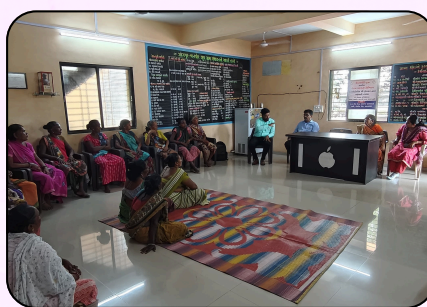
Community meeting at Gangpur village for Bardoli vision centre on 17th July